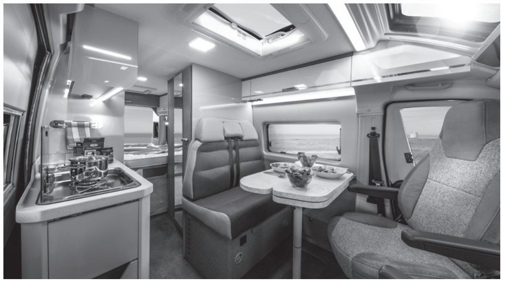
The Davis 590 Lifestyle includes everything camping fans could ask for.